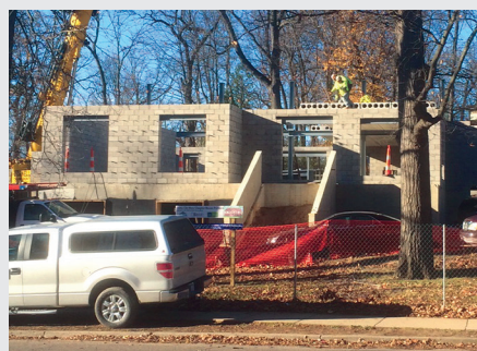
November 20: The house from the base of the front steps.