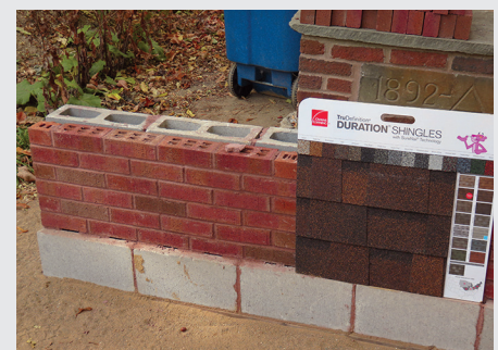
Final sample of the house brick and shingle colors.

Join us in finishing the house. To make your pledge, please: