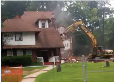
June 30, 2015: Demolition of the old house is completed.

On Tuesday, June 30, 2015, the house demolition (Phase 1) started at 10:00 a.m. in the morning and by 1:15 p.m., the house was in rubble, piled in the basement. For the past six months, contractors have been working diligently to prepare the lot for the foundation (Phase 2), pour the foundation (Phase 3) and begin construction on the first two floors (Phase 4). We encourage you to look through these photos and those online at deltachimichigan.com which show our progress in anticipation of next year's dedication and move-in.