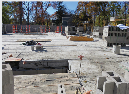
November 5: The main floor planks looking toward Washtenaw.