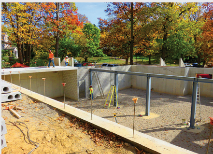
October 26: Starting placement of main-floor planks.