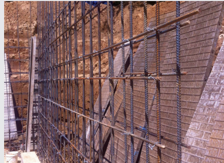
August 22: Rebar in place for the concrete foundation.