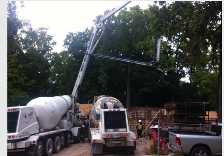
August 29: Concrete pumper and transit mix pouring foundation.