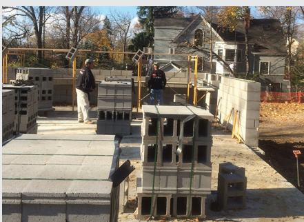
November 7: Block work being completed in the kitchen area.