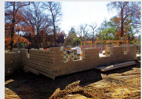
November 5: The house from the back.